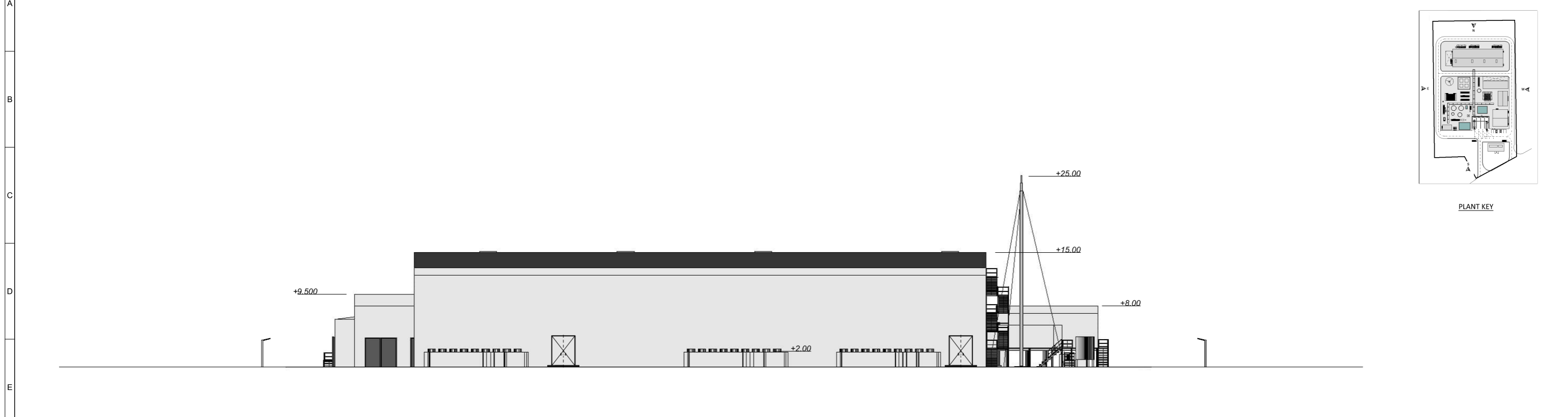
VIEW FROM NORTH